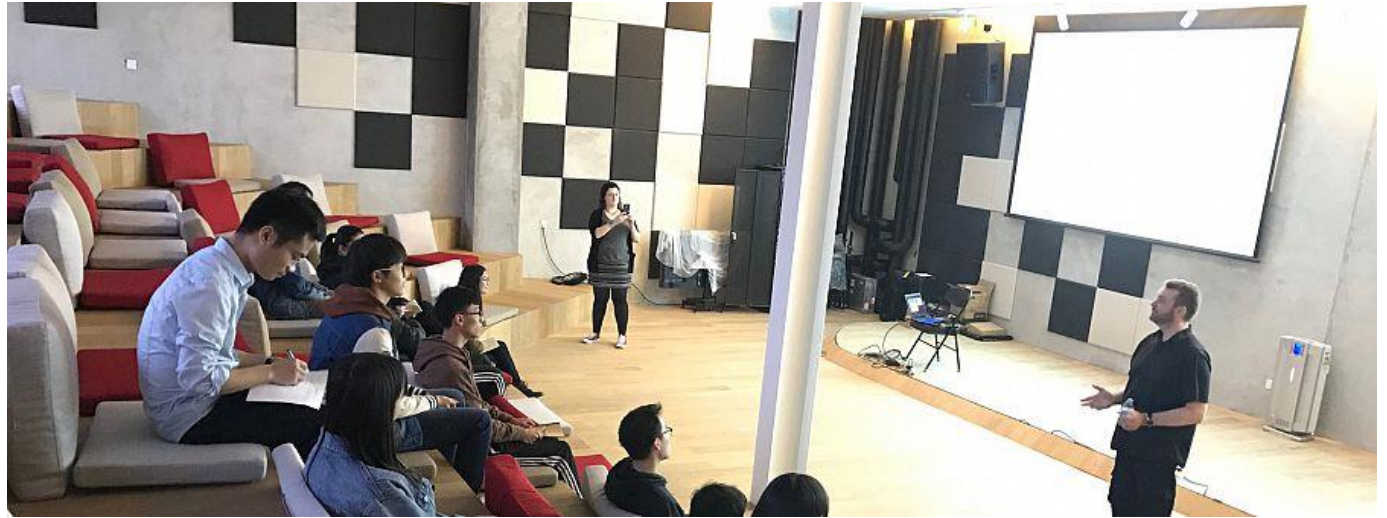
Teaching at Pixseed, Perfect World's digital arts school in Beijing